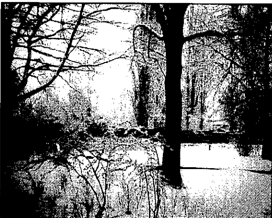
Feb 2006 Blizzard Blankets Rockland