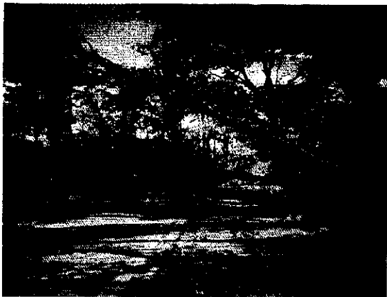
Sept 1999 Tropical Storm Floyd